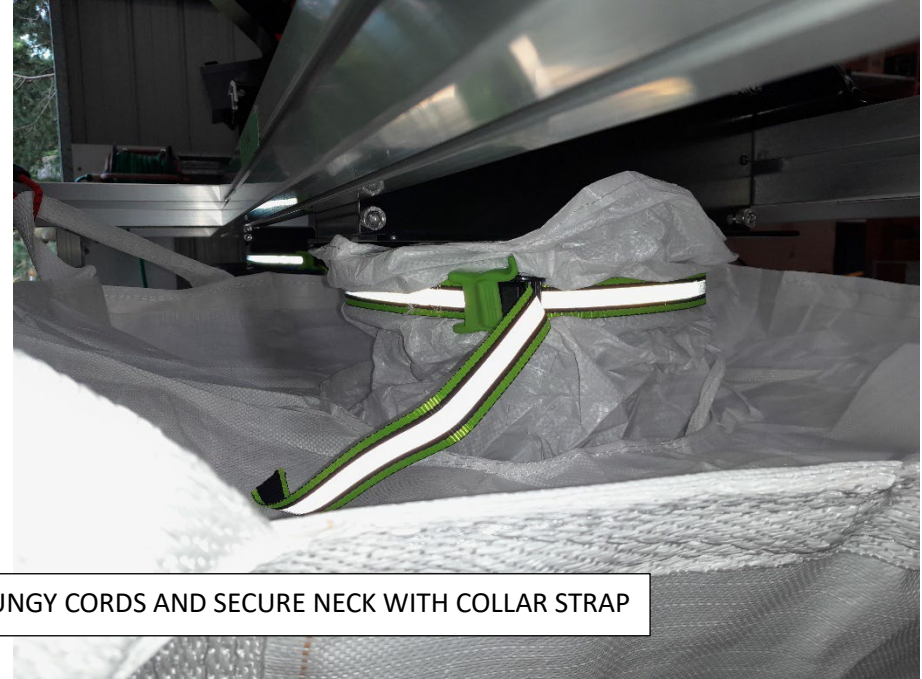
SECURE HALF TONNE BAGS WITH BUNGY CORDS AND SECURE NECK WITH COLLAR STRAP

EXPLECO GLX MAIN STAND ASSEMBLY AND OPERATION REFERENCE TO EXPLECO GLS2 OPERATION MANUAL